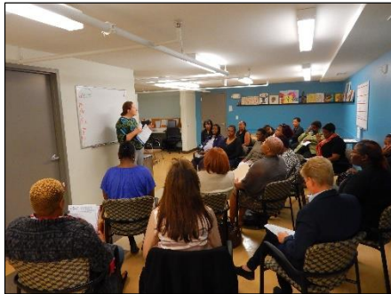
Women participate in a group presentation, job searching session, and Job Club meeting.

Step Up DC participants have been placed in jobs in the following industries: retail, health care, education, entertainment, tourism, IT consulting and security.